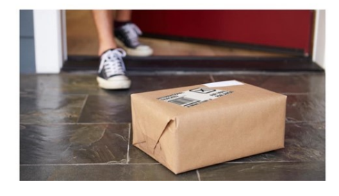
Parcel thefts rise from doorsteps as gangs follow courier vans

Great care with internet shopping parcel deliveries which get left on doorsteps. Firstly, in town areas you are vulnerable to the passing chancer and opportunist who just happened to be walking by. However, secondly the vans are now followed and that means even the most rural of isolated properties are also vulnerable. Criminals know this!