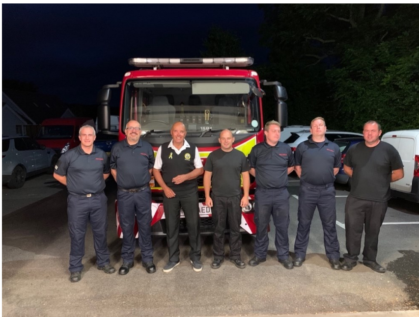
ALDINGTON CREW with myself on recent visit.

During the meeting I have agreed to help promote recruitment for on call fire fighters in Aldington. It is essential that enough recruits join the service to ensure the appliance is crewed available for the locality and surrounding villages. Operations this year has seen appliances deployed a long way from their stations and Aldington is no exception. When I retired from the Brigade, I was Head of Operations for the whole of Kent and I had 66 fire stations under my command. Sadly, that number has been reduced so ensuring the ones we have are crewed is essential.